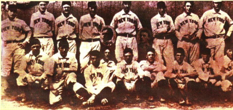
Champions of 1908 - McGraw's Giants. On the Club Roster Were Such Names as Evers, Wills, "Dummy" Taylor, George Brown, Doolin, McCormick, McGinnis, McGinn, Ames, Bowdoin, Gilbert and Marshall

Launched in only 1987 with the 480, and with the 440/460